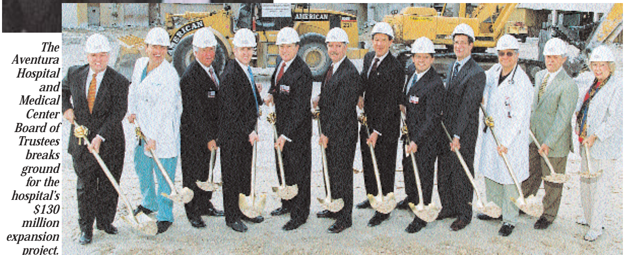
The Aventura Hospital and Medical Center Board of Trustees breaks ground for the hospital's $130 million expansion project.