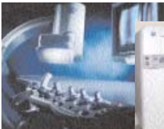
Cardiac catheterization lab

Aventura Hospital and Medical Center provides healthcare services throughout the year for which the hospital is not compensated. In 2002, the dollar value of this care totaled almost $24.7 million. This amount includes approximately $3 million in charitable care and $1.7 million in care provided to patients who meet federal poverty guidelines – and for which payment is waived. Additionally, the amount of patient care provided for which billing is uncollectible totaled approximately $20 million.